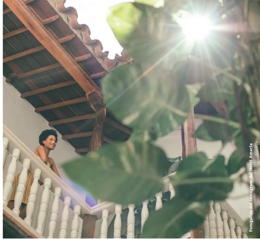
Fotografías del Instagram del Hotel Amarla